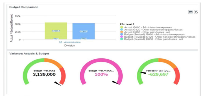
Budget - actuals comparison 1