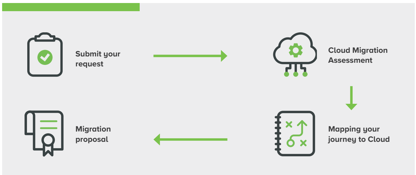
Figure 1: The Cloud Migration Assessment Process

You will get an onboarding plan with clear timeframes and responsibilities for the entire migration process, including any required system upgrades/updates.